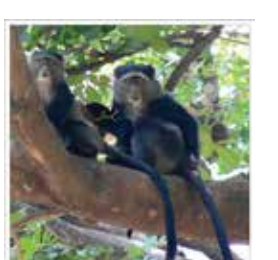
Blue Monkeys at Kasyoha Kitomi CFRs