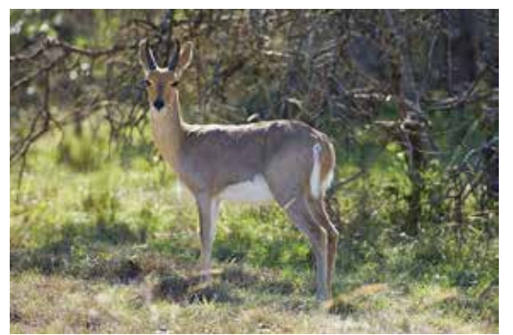
Reedbuck at Kadam CFRs