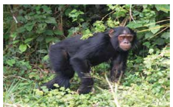
A primate at Kasyoha Kitomi CFRs

Research and tourist trails for Chimpanzee tracking.